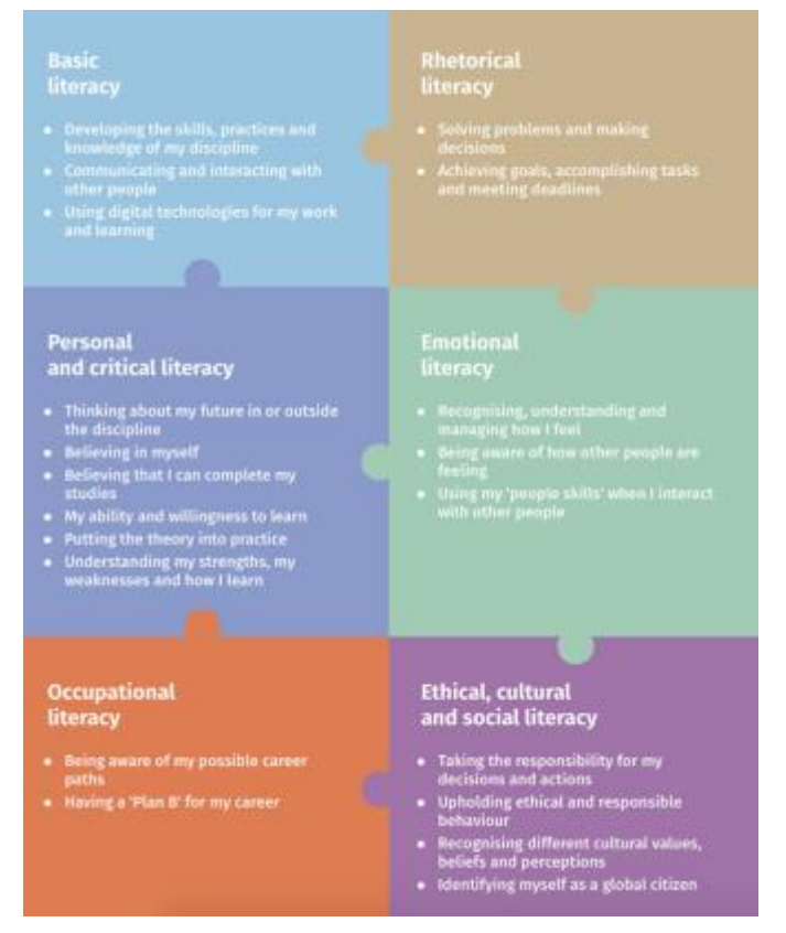
Figure 1: Student (plain English) version of the Literacies for Life (L4) model

The measure underpins a metacognitive model of employability in which employability is defined as "the ability to create and sustain meaningful work across the career lifespan" (Bennett, 2016). The model's six inter-related Literacies for Life combine to enhance employability and inform personal and professional development. The student version, illustrated at Figure 1, was shared with students as part of their profile and workshop.