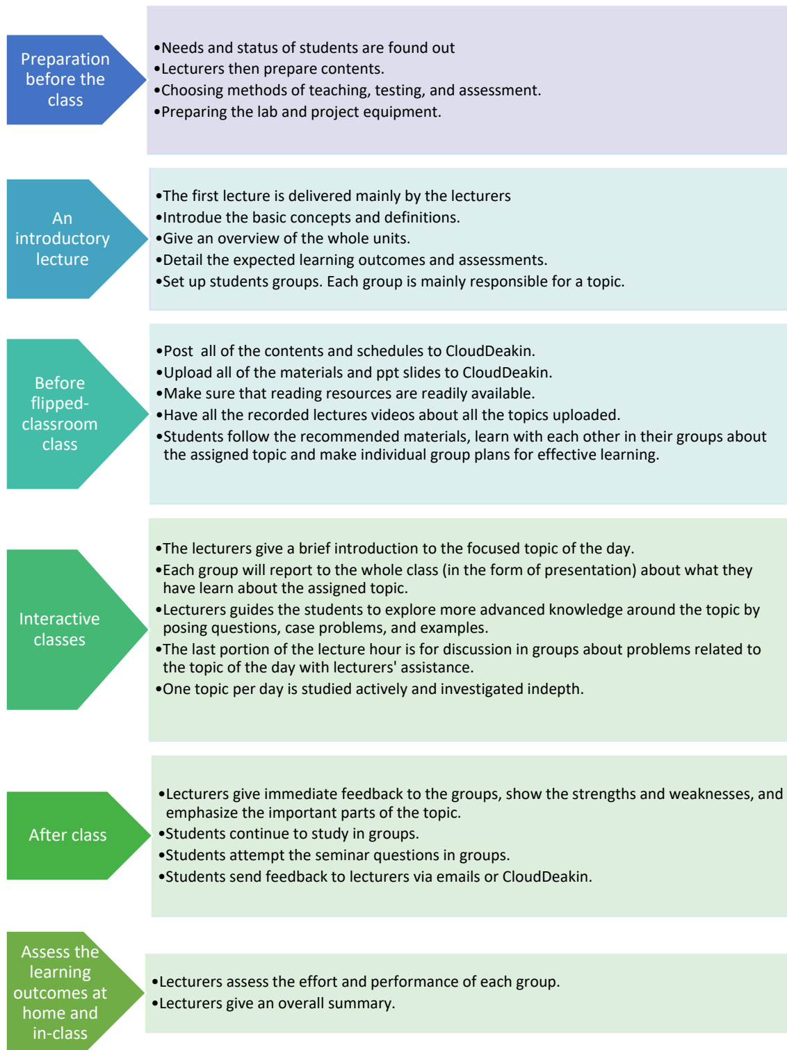
Figure 3: Detailed implementation of the flipped classroom for SEEW321 (after Biggs and Tang, 2011).

Another important step is the presentation (step 4 in Figure 3). Some studies recommend to have in-class discussion. However the students tend to be shy. As being their first time in this approach, they tend to passively listen rather than speaking out. The in-class, group presentation is an ice-breaking technique so as to guide the student to gradually express their opinion publicly and thus actively participate to the learning and study.