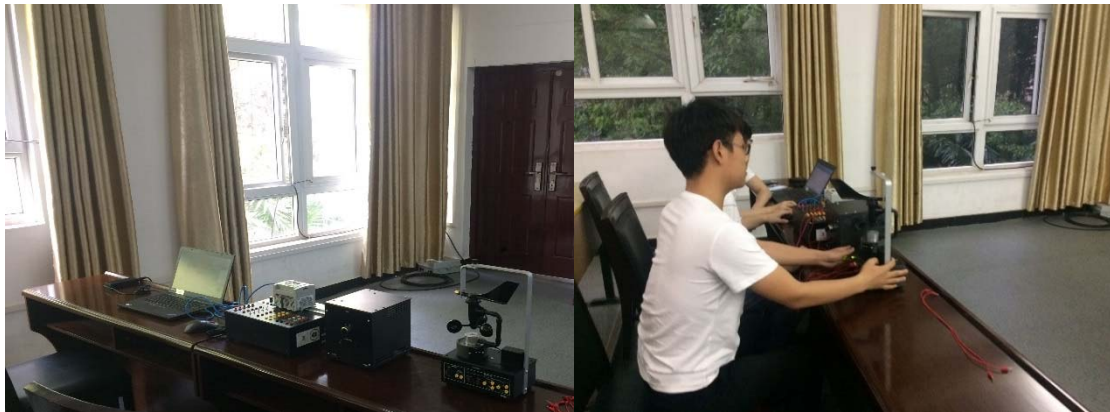
(a) The complete platform

programmable logic controller (PLC) was presented first. Then students were given design problems, starting from basics, then gradually progressing towards more advanced levels.