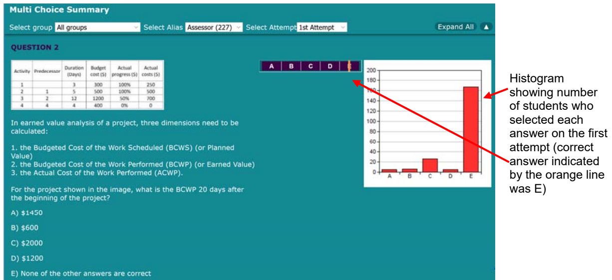
Figure 3: SPARK PLUS Multiple-Choice Multiple Attempt (MCMA) instructor analytics screen.

In this study discussion forum posts, a student survey, tutorial discussions and analysis of exam results were used as data to investigate how students' behaviour changed because of the threshold exam assessment, and the impact it had on their learning.