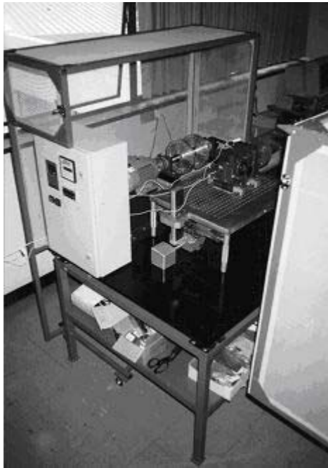
Figure 3: Machinery Fault Simulator for modelling of mechanical faults