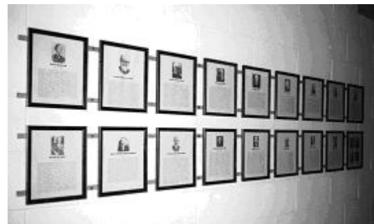
Figure 4: Galleries of famous engineers and scientists (general, above and tribologists, below)

The galleries of famous engineers and scientists depicted in figure 4 (one general, and another one in the area of tribology) give to students insight in the history of engineering – how different engineering and design rules were introduced in engineering practice, and helps them to feel proud for their profession.