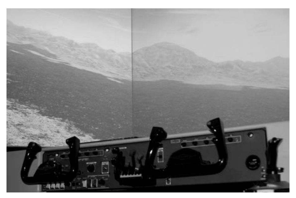
Figure 2. The Aviation Safety Studio showing the large screen flight simulator.