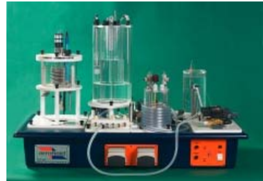
Figure 1: The Armfield experimental rig