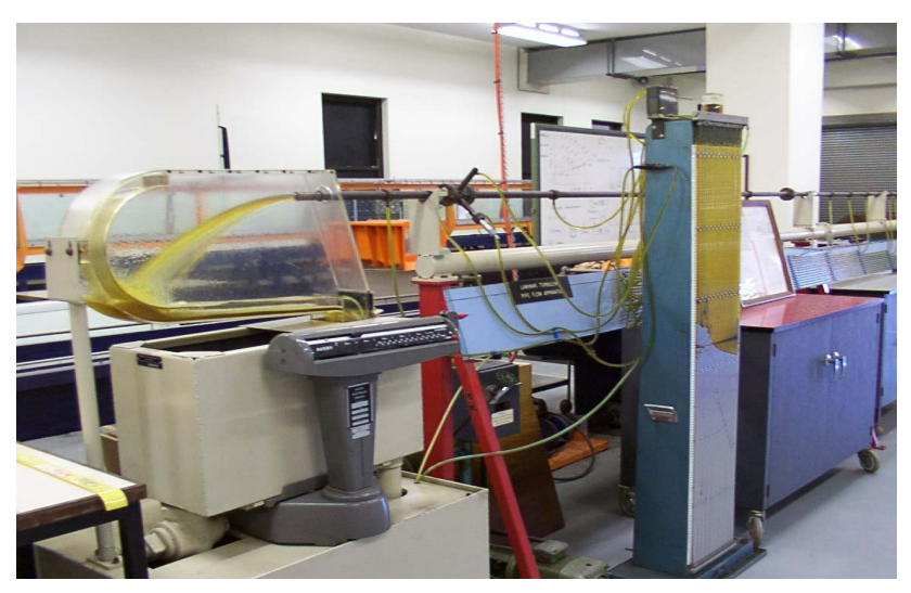
Fig. 1. Laboratory equipment of flow through pipe

The equipment (Fig 1) consists of a 6.1m long brass pipe through which oil is continuously circulated by a hydraulic pump. The pipe has nineteen piezometric tappings that are each connected to a mercury-filled manometer to measure the pressure at specified locations along the pipe. The flow in the pipe can be maintained laminar up to a Reynolds Number (Re) of about 2000. Turbulence is initiated by inserting a rod at the upstream end of the pipe; the flow can becomes turbulent at an Re of about 5000. The pipe discharges into a transparent perspex catchment so that the difference between laminar and turbulent flow can be visually observed.