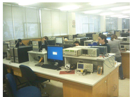
Figure 2 – Undergraduate teaching labs

A new set of experiments were developed, with the key feature of a printed, bound lab book with experimental instructions and spaces for students to answer questions or make notes as appropriate. Having these notes avoids a problem in undergraduate lab work of insufficient recording of results and students' general inability to keep lab notes organized. Providing soft copies of lab notes has also proved ineffective in the past, as students tend to avoid printing the notes and instead attempt to flick between windows on lab PCs.