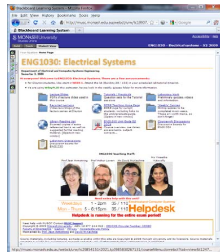
Figure 1 – New Blackboard website design

Improvements were made in many other areas: changes to the unit website to make it friendlier and more organized (Figure 1); the introduction of 'team teaching' with two lecturers in attendance at most lectures; the adoption of tablet-pc based lecturing in a similar fashion to (Hulls, 2005) but with the addition of video recording; and adoption of online discussion boards and online announcements as the primary communications channels between staff and students.