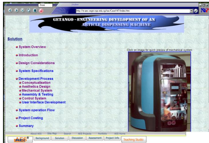
Figure 3: Screenshot from a Project Study

The explicit project knowledge is enhanced by a combination of appropriate media, such as text, graphics, images, schematic diagrams, engineering drawings, videos, and animations. Besides comprehensiveness and appropriateness to content, the use of multi-media generates interest, and also caters to different learning preferences.