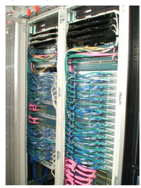
Figure 1 Netlab Servers and associated laboratory equipment

fully furnish the Netlab server with 8 pods of equipment the total cost would be between $US 45,000 to $US 60,000 depending on the equipment combination (assuming that a discount of around 70% is available to academies from Cisco Systems). Each pod of equipment can also provide support for a maximum of 5 remote PCs by the implementation of virtual machines through 3<sup>rd</sup> party products such as VMware server from VMware (VMWare).