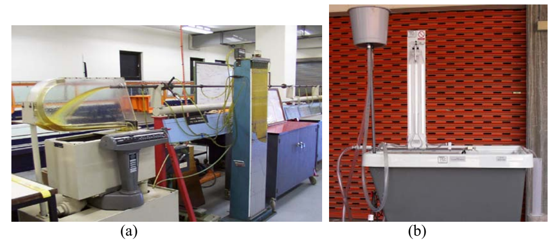
Fig. 1. Laboratory equipment of flow through pipe – (a) Big rig; (b) small rig

For last two decades the flow through pipes laboratory experiment was conducted using a large experimental rig featuring a 6.1m long central pipe – the "big rig" (Fig 1a). In early 2010 the mercury manometers used to measure pressure in the pipes began to leak, making the rig unsafe for use by students. This saw the introduction of a small laminar-turbulent flow experiment setup this year, which became known as the "small rig" (Fig 1b). At the same time, work is underway to build a remotely accessible version of the experiment for integration into the LabShare network; this version of the experiment is known as the "remote rig" or the "online rig". Therefore, three experimental setups are used for this study: laboratory hands-on version big rig, laboratory hands-on version small rig, and remote lab (online) version.