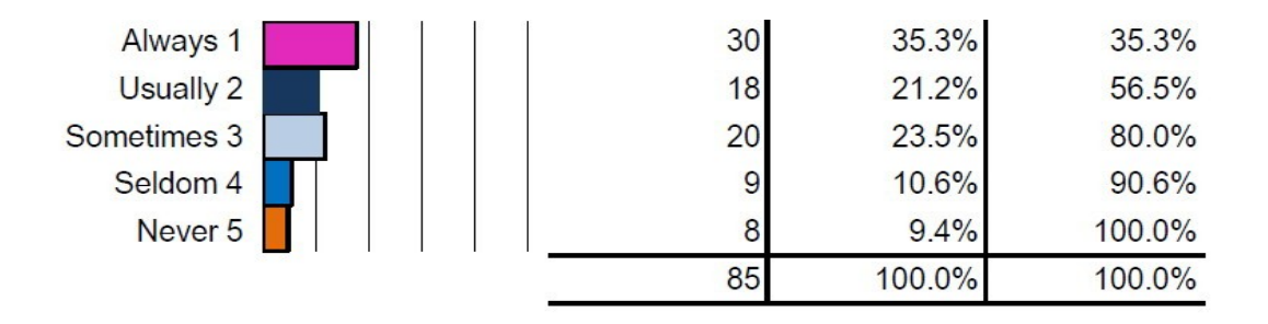
Figure 3: Student response when asked if it has been a positive experience having the 4<sup>th</sup> year mechatronics class running occasionally in the same laboratory space.

The students were asked in one survey toward the end of the semester if they felt that the parallel mechatronics class was a positive experience. Their responses were analysed and the results are shown in Figure 3. Something like 18% of the class should have little or no exposure because they fell in the class scheduled when mechatronics did not run coincidentally. Figure 4 shows the results when the same analysis is carried out on a question to which we have a reasonable idea of the answer: Whether the students were able to access resources. We expect all students to have access to resources but not always in a timely manner because resources will occasionally be overloaded. The results are very gratifying, since about 20% responded to the effect that they seldom or never had a positive exposure to mechatronics while 2% said the same for resource access, exactly as one might expect. The remaining students Always, Usually or Sometimes had a good experience.