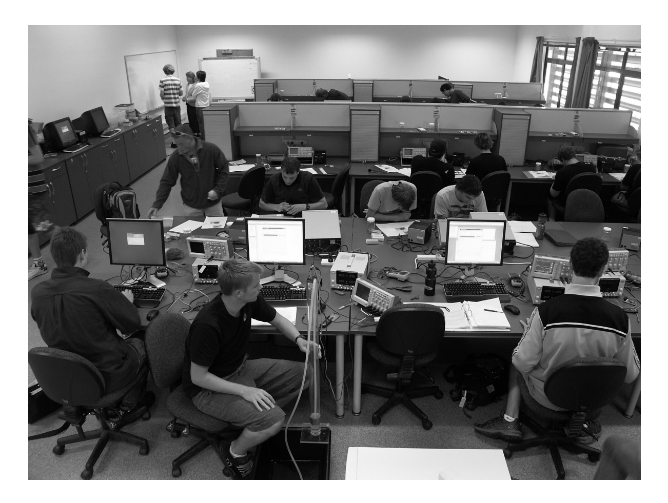
Figure 1: Mechatronics (ENEL417) students in the foreground seated facing away from the camera and Electronics (ENEL111) students seated facing the camera and in rows and bays farther in the background.