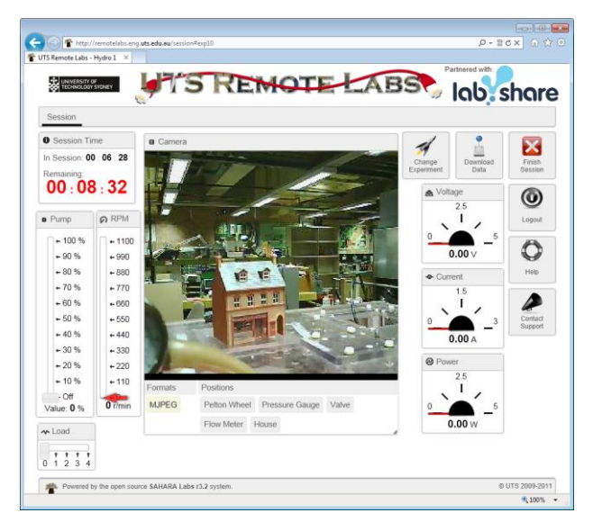
Figure 1: A typical remote laboratory system:

Remotely accessible laboratories (or "remote labs") represent a novel resource in supporting improved access to a diverse range of educational laboratory experiences. A remote lab is based on instrumenting a physical laboratory apparatus so that it can be monitored and controlled via the internet, with the result that users need not be physically present with the apparatus. An example of a typical remote laboratory interface is provided in Figure 1.