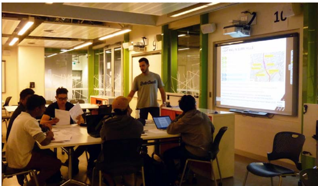
Figures 2 & 3: New Interactive Learning spaces in use during Block Sessions.