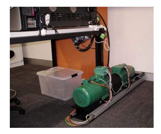
Figure 2 Teaching facility control station

Figure 1 Teaching Facility motor assembly