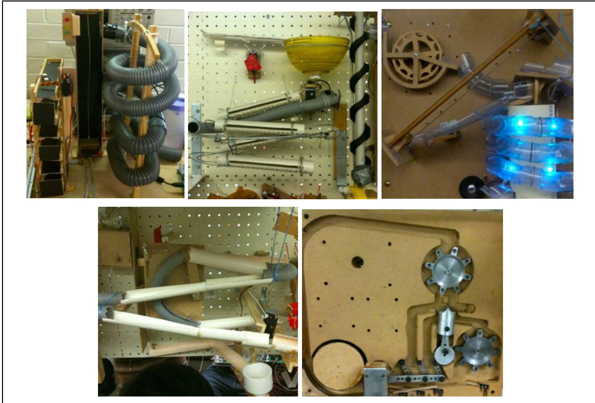
Figure 2: Some modules of the Crazy Machine in 2012

On the last laboratory session of the semester all machines were demonstrated. Four machines out of eight worked according to specifications. Three worked partially or intermittently, and one team did not present a machine. Feedback was provided during the demonstrations. Additionally, students prepared a 15-minute oral presentation in which they shared their designs and experiences.