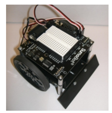
Figure 1: SumoBot robot from Parallax (Parallax, 2014)

The SumoBot from Parallax was utilised as the robotic platform facilitating the robot practicals (Parallax, 2014). The SumoBot provides continuous rotation servo motors for locomotion, different sensors for detecting physical quantities, a microcontroller which can be programmed for controlling the robot and a breadboard for integrating custom electronics. The provision of the breadboard allows students to implement electronic circuits in a similar manner to that previously achieved using the breadboard included in the Home Electronics Laboratory Pack (HELP) (Long, De Vries, Hall, & Kouzani, 2008). As discussed by Long et al. (2012) the practicals needed to cater for both and ON and OFF-campus students, so the SumoBot was added to a revised HELP (Long, Horan, & Hall, 2012). To enable students to undertake the necessary practicals, the SumoBot's onboard microcontroller was preprogrammed to execute simple movements in response to the outputs of the student's electronics circuits.