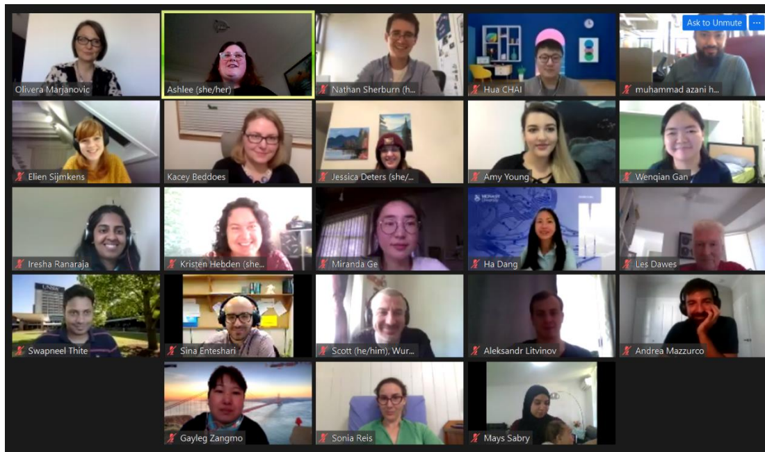
Participants at the 2020 AAE HDR symposium

Some key take aways included the value in connecting with other PhD students in engineering education, tips and tricks on undertaking specific analysis methods, and the importance of opportunities such as this for students to seek feedback and perspective from outside their supervisory team. We're looking forward to follow ups during the year and an improved offerings in 2021.