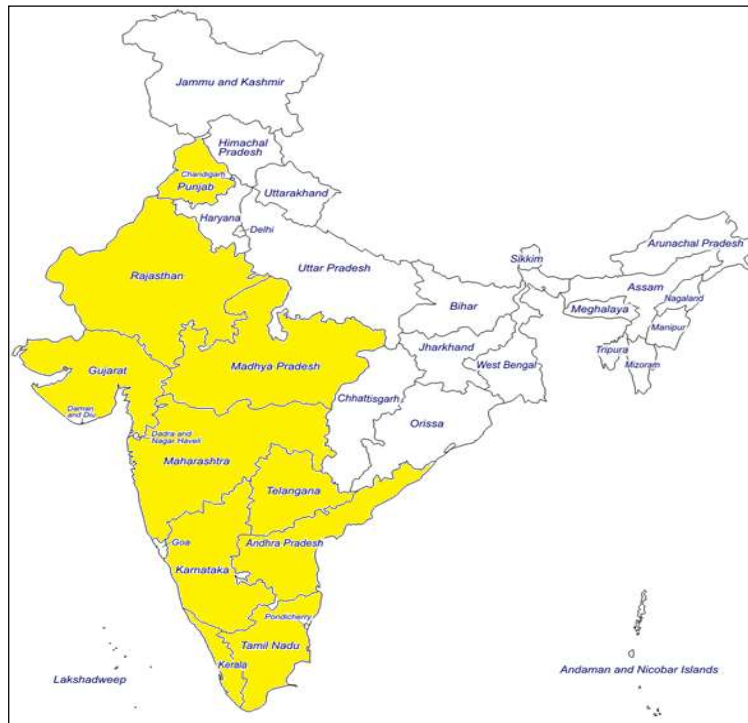
Figure 2: Faculty respondents' representation from different parts of India