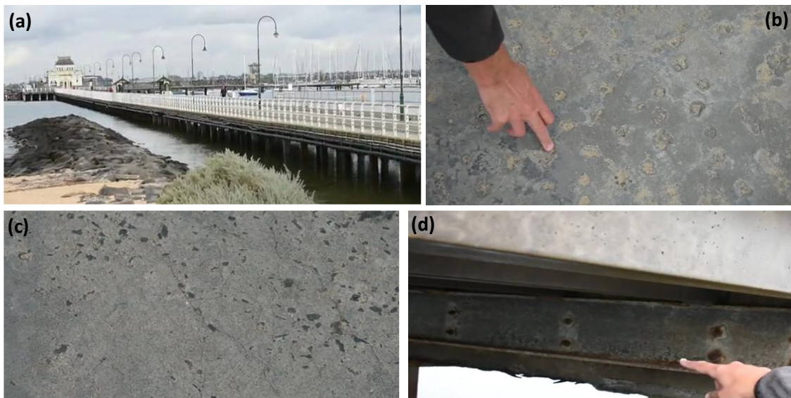
Figure 1: Site Investigation of St Kilda Pier, Melbourne (a) St Kilda pier, (b) Salt crystallization, (c) Surface cracks and (d) corrosion of steel

the visual defects present on the deck slabs are identify and recorded in the field visit. Detailed information related to these defects is provided in classroom. This is supplemented by inspection data supplied for the substructure. Once all the information has been obtained including designs, inspections and, test data, the future strategy can be decided. This depends on the design life, the results, the costs and budget, Fig. 2, each group being given a unique set of data. Students need to identify appropriate repair techniques for concrete slabs and substructure and quantify the total extent of each type of defect for the reinforced concrete elements. The students then undertake a lifecycle analysis of the various repair option to identify the optimal repair strategy given the repair costs and effective lifetimes for the various repair options.